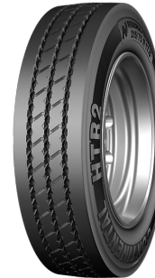
Tire Picture 1)